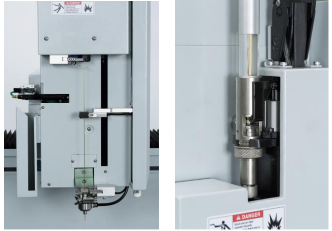
Automatic Electrode Changer and Tube Feeder